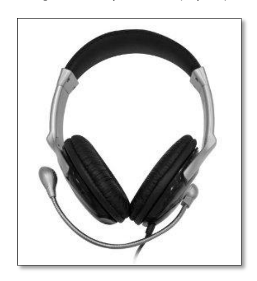
Figure 1. Example Headset (Yapster)

There are a proliferation of inexpensive, quality audio headsets used in computer gaming applications. Examples of these are the , Yapster or Yapster Plus (TM-YB100P). The Yapster is shown in Figure 1.