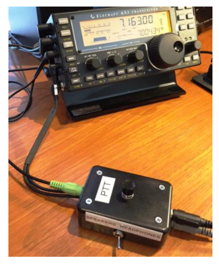
Figure 2. Prototype ASU Connected to KX3 Transceiver Audio Output and Microphone Input