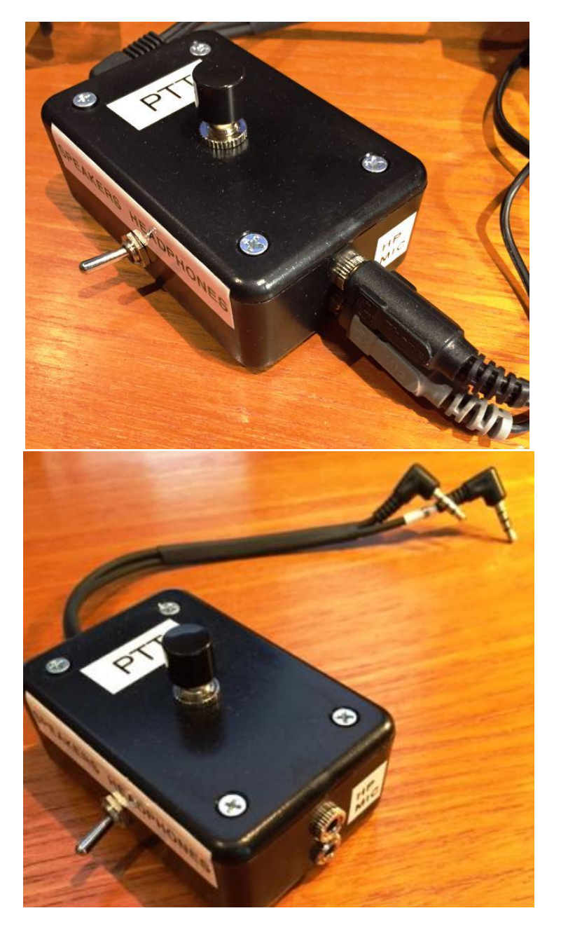
Figure 4. Construction of Audio Switch Unit Box Prototype

Caption: Plastic enclosure, 2" x 3" x 1"